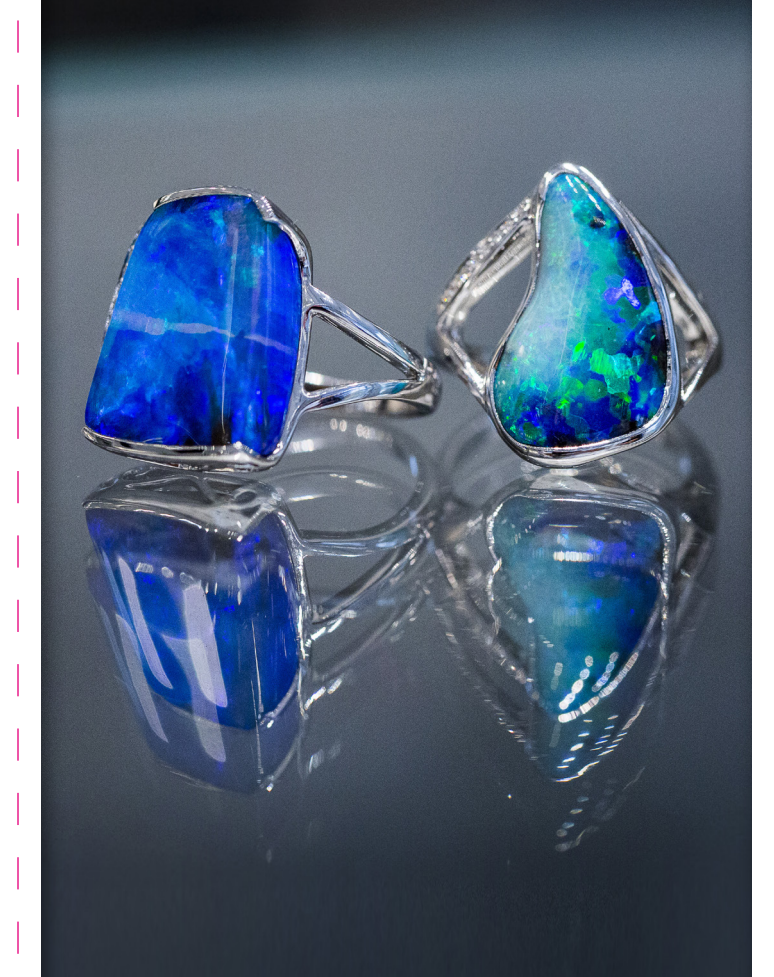
Established in 1992, Cosmopolitan Jewellers has gained an unsurpassed reputation for excellence in design, manufacturing and service. Cosmopolitan Jewellers is Australia's largest retailer of designer black and boulder opals and South Sea pearl jewellery, and offers

Internationally renowned luxury jewellery store, specialising in